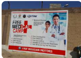
IFGF church, F7/4, Islamabad August 19th, 2018